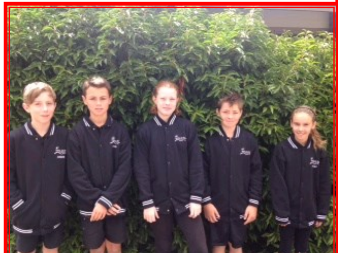
School Student Leadership Team