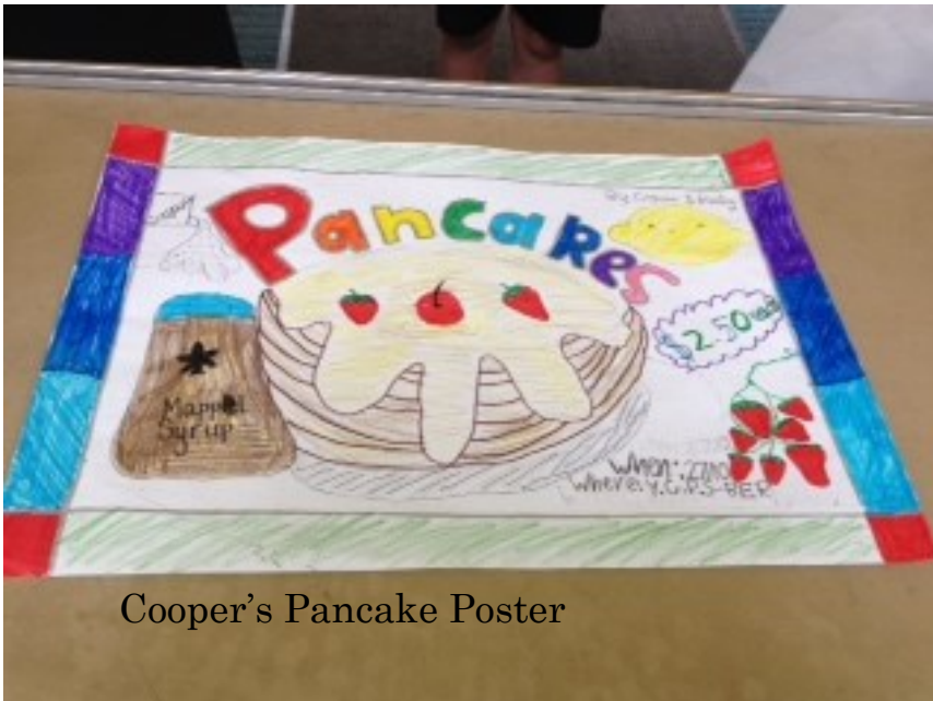
Cooper's Pancake Poster