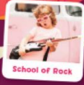
School of Rock