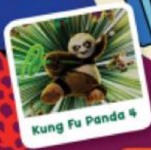
Kung Fu Panda 4