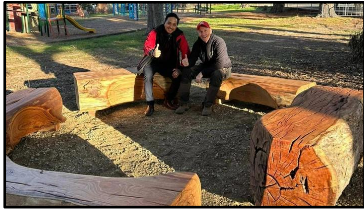
Installing our YGPS yarning circle